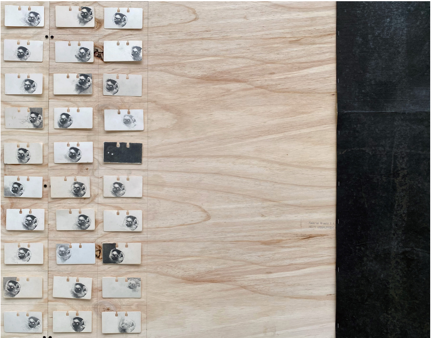
Detail of the installation @Bodega Piloto (2022)

The Luis Caballero Award—named after one of Colombia’s most important artists—is the most prestigious visual arts award in Colombia. It was created by the local government in 1996 to highlight the work of mid-career artists, which are selected upon a public call. Held every two years at the Galería Santa Fé in Bogotá, the award presents newly created works funded by the production fund of the award. Since 2010, the award has taken place also at other locations around the city, allowing artists to create site specific works on view for about a year each. In the past, some of those locations have been the National Archives, the Heroes Monument, and the Museum of Modern Art in Bogotá. At the end of the exhibition cycle, a special jury appointed at each iteration, selects the winning artist.