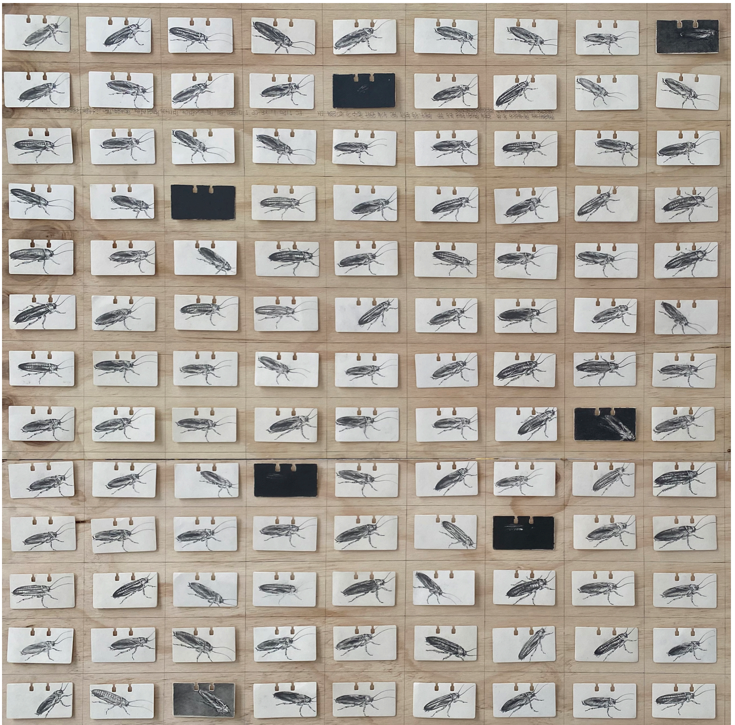
Detail of the installation @Bodega Piloto (2022)

graphite stick, depicting a somber, dark landscape—just as Colombia’s own political and violent history was undergoing in the 1990s and early 2000s. At that time a big part of the country’s population was forced to migrate to survive the war; resiliency was their only option to start a new life in a different place.