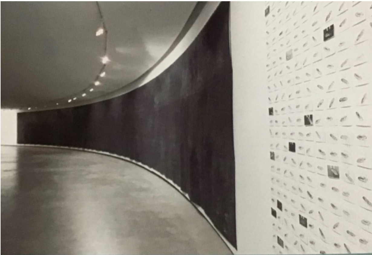
Installation view at Galería Santa Fé in 2000.