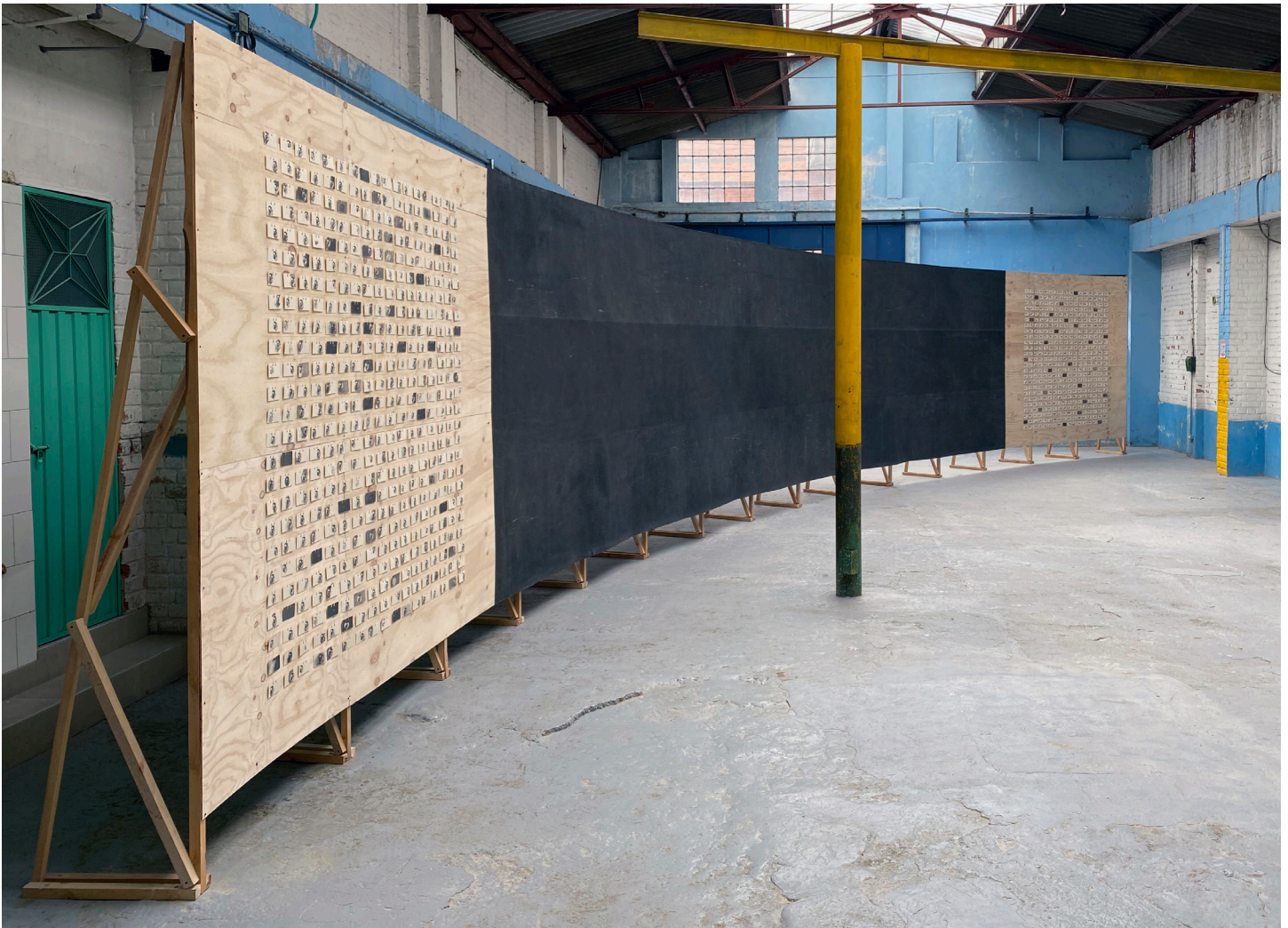
Installation view @Bodega Piloto (2022)